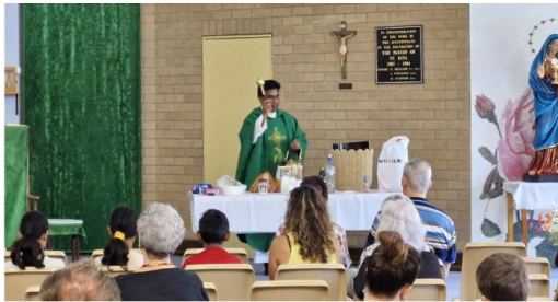
Salt Mass 9am Sunday

The Salt Masses at the weekend were filled with love and blessings. Thank you to all who bought in their items for blessing.