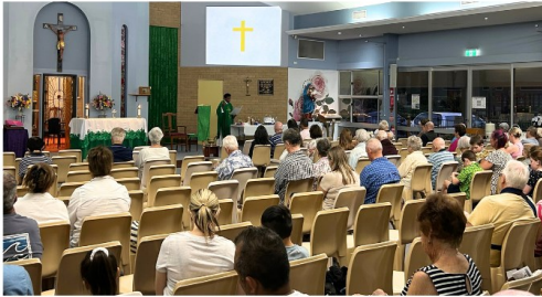
Salt Mass 5pm Saturday