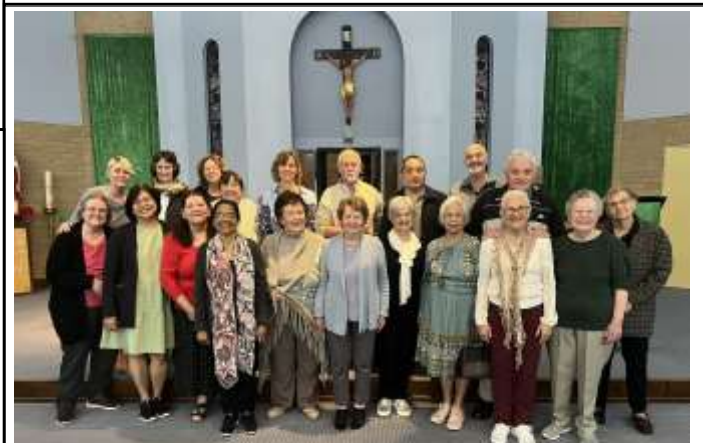
Hosanna Praise and Worship have celebrated the 10th Anniversary in St Rita's Parish with Mass and light super.

https://tinyurl.com/St-Stephens-Cathedral-Masses